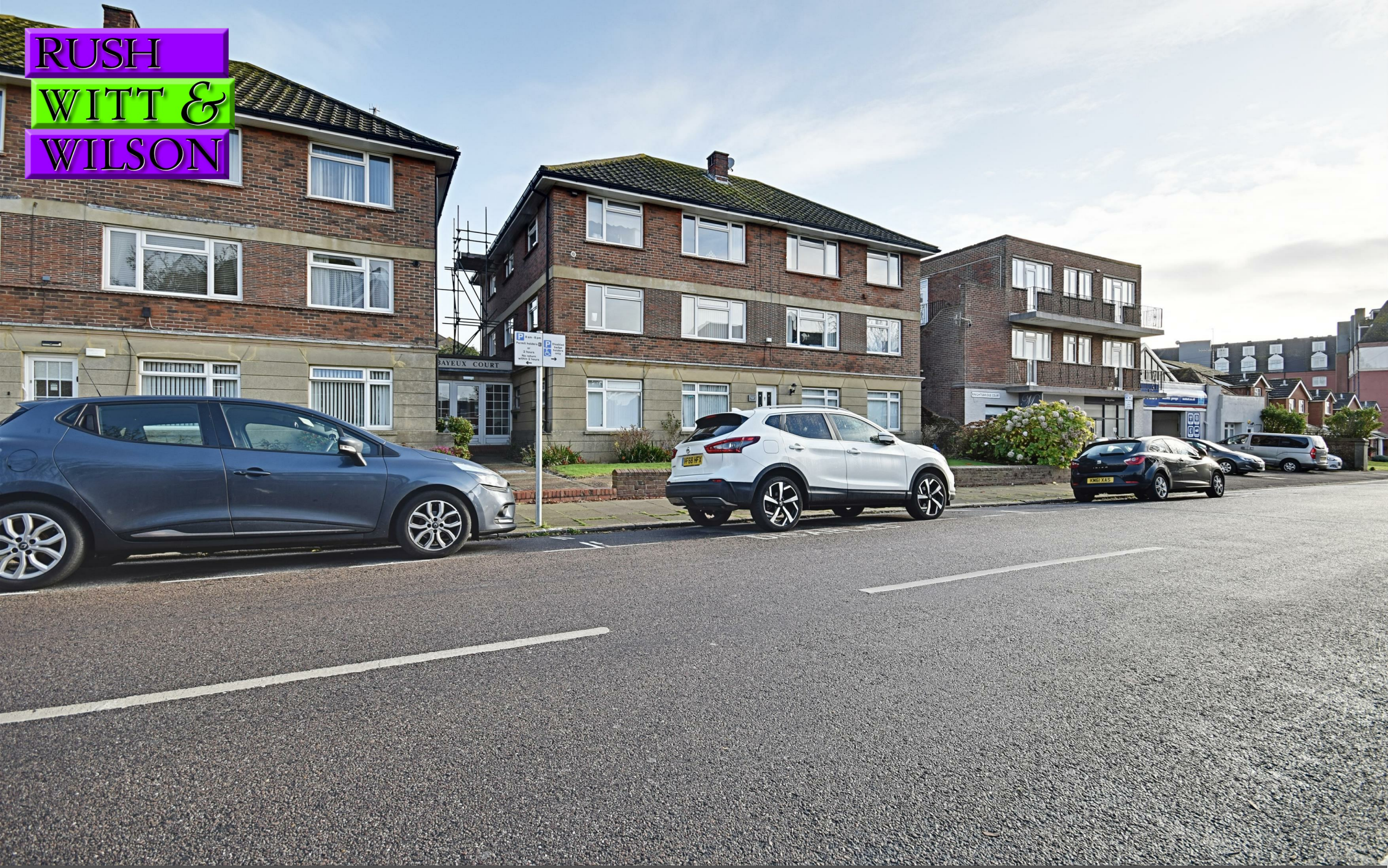
7 Bayeux Court Middlesex Road, Bexhill-On-Sea, East Sussex TN40 1LU £179,950